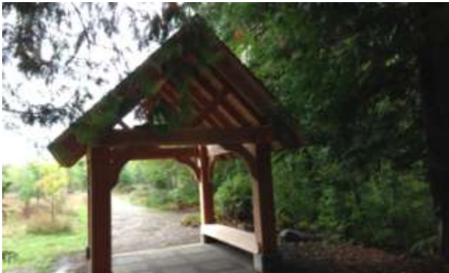
Main entrance gate

The usual way to transport a body to the gravesite is by pallbearers. Families choosing an alternate form of transport, for example, using a horse-drawn wagon, should discuss their plans with us beforehand.