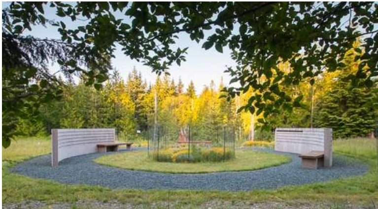
Memorial walls and benches in the Gathering Space

The Gathering Space is defined by two low, semicircular walls, designed to display about 1,000 small metal plaques. Each plaque provides the name, date of birth, and date of death of one person whose remains are buried or scattered in the Cemetery. If desired, a short epitaph may be included.