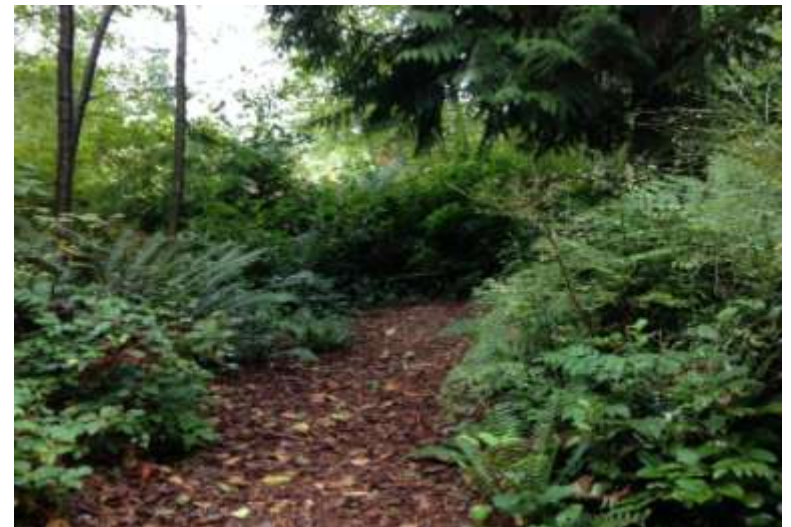
Path leading into the Scattering Area

We will discuss the scattering process with you when you purchase the Permission to Scatter Cremated Remains . As well, our representative will attend to show you the Scattering Area and answer any questions you may have.