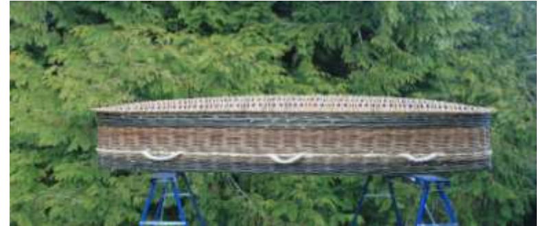
Willow coffin made on Denman Island

A container is not required for natural burial. However, if you choose to use one, a cardboard or willow coffin or a simple box of untreated wood can be purchased relatively easily. Contact us to learn more about these options.